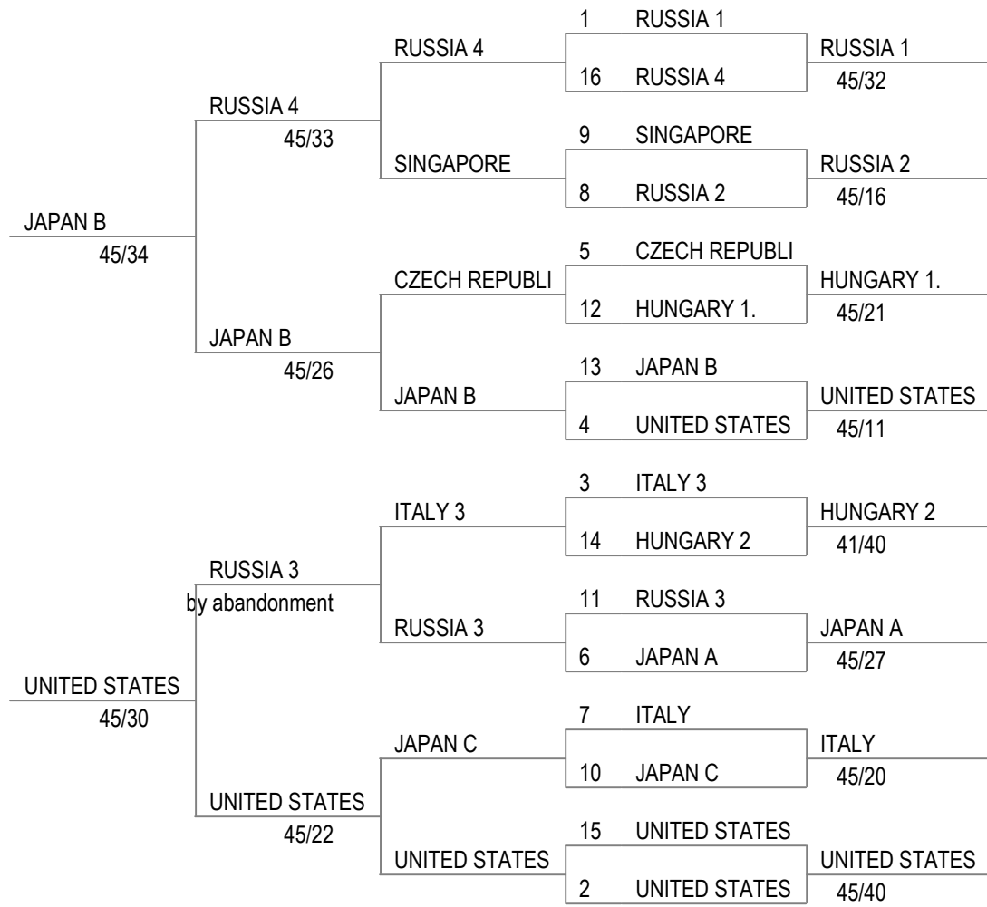
Tableau 9-16 of 4 Tableau 9-16 of 8 Tableau of 16