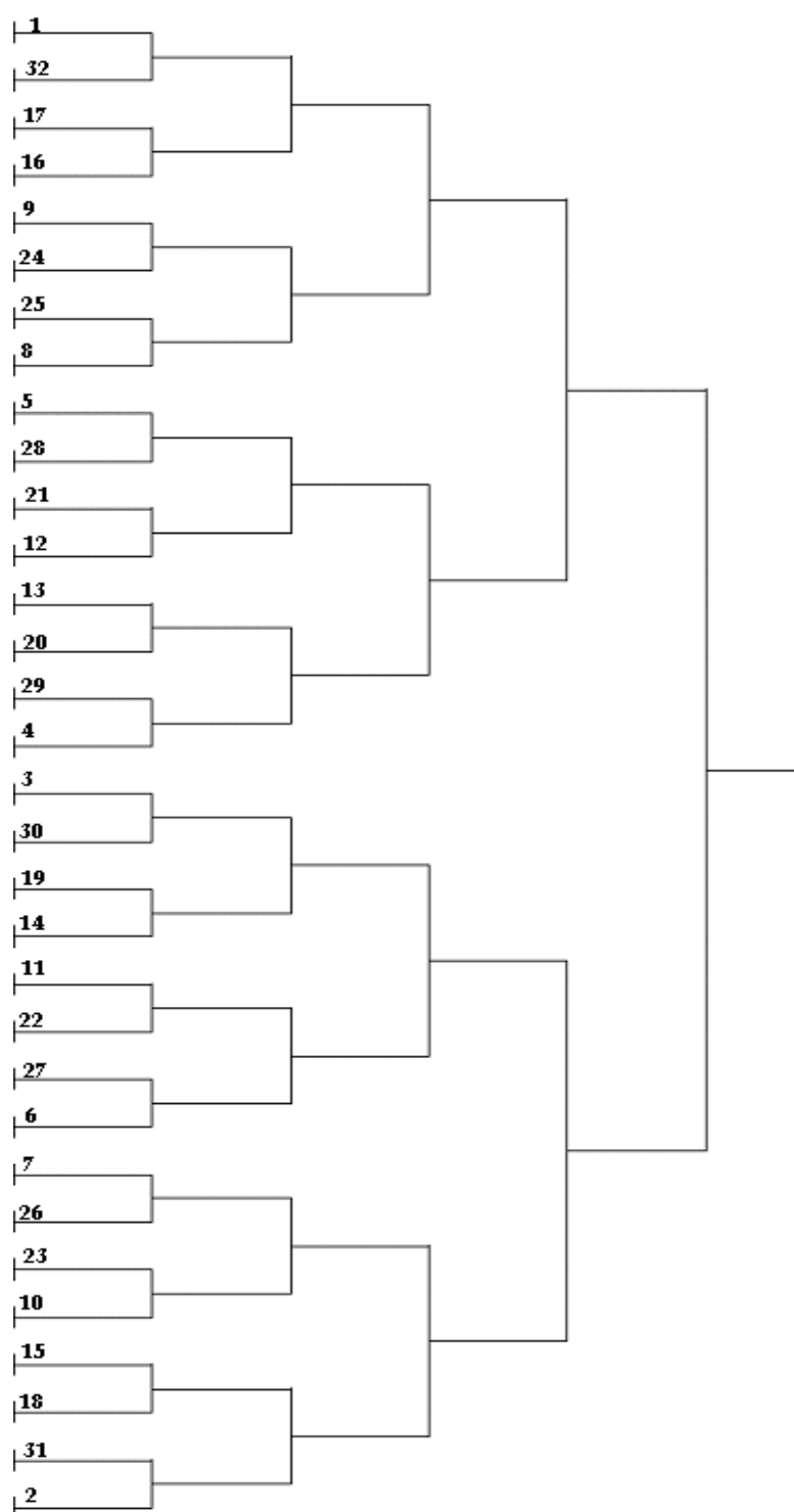
Figure 7a. Bout plan for individual direct elimination (table for 32 fencers)